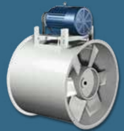
CAST ALUMINUM FAN WITH TEFC MOTOR